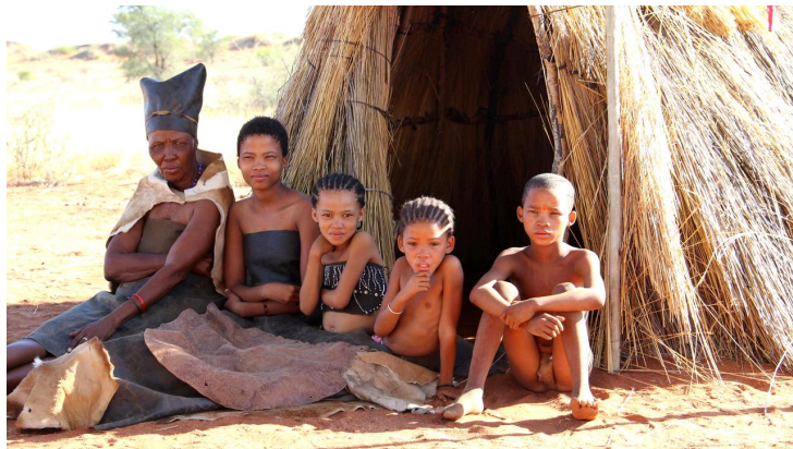
A San Family Group at home in their village surroundings