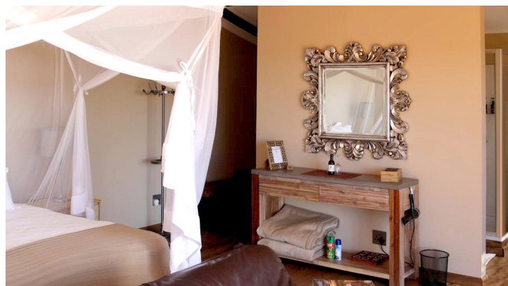
The luxurious interior of an Exclusive Dune Chalet