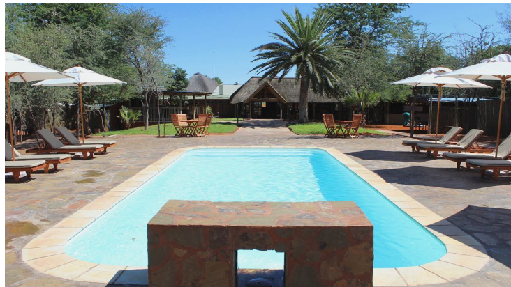
Our beautiful pool also has a panoramic view over the dunes