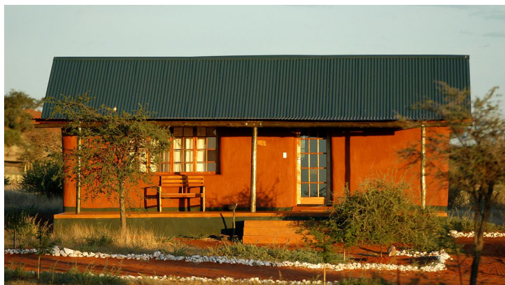
Savannah (previously known as Strohbale) Chalet - built from straw bales

A little miracle set in the sands of the Kalahari