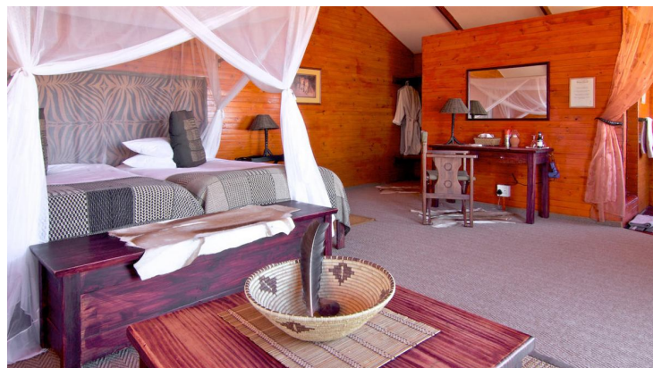
Spacious and charming interior of a Dune Chalet