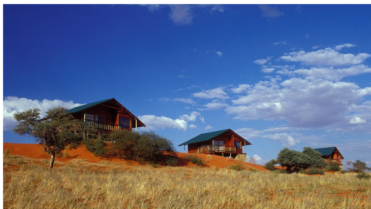
Dune Chalets amid the red sand of the Kalahari