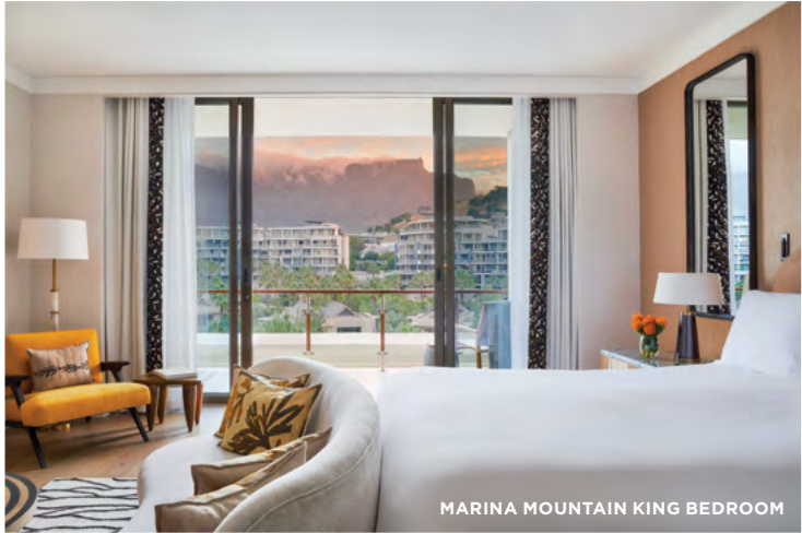
MARINA MOUNTAIN KING BEDROOM