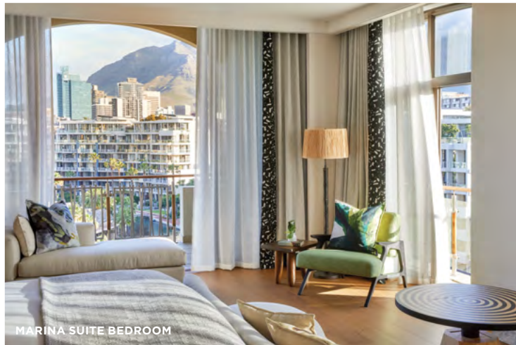
MARINA SUITE BEDROOM