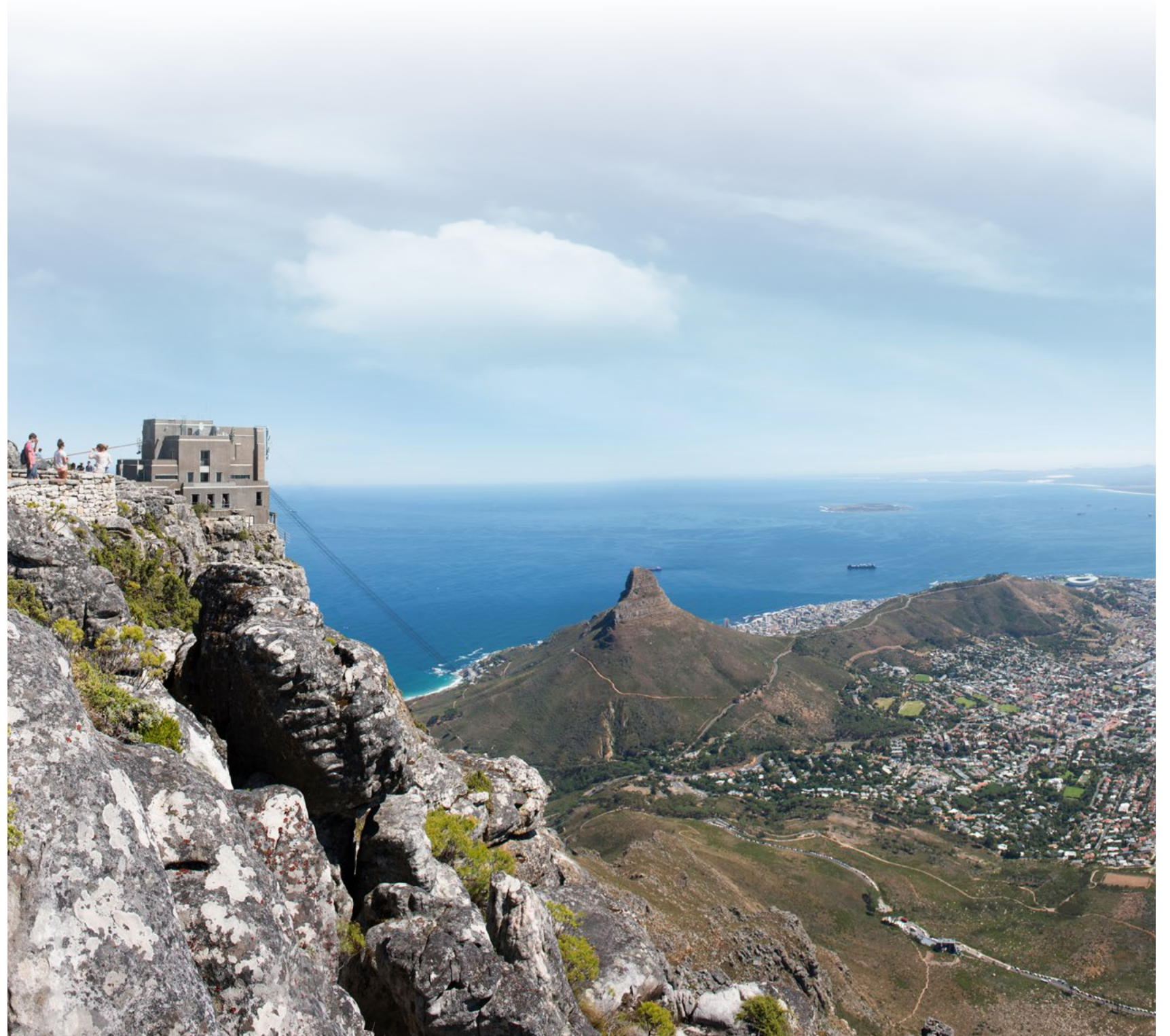
Table Mountain is a great source of pride to all Capetonians. At 260 million years old it is older than the Andes, the Rockies, The Himalayas and the Alps, and was once under the sea. It was recently crowned as the seventh natural wonder of the world. A four minute cable car ride will take you to the 1067m “table top”, with spectacular views on the way up.